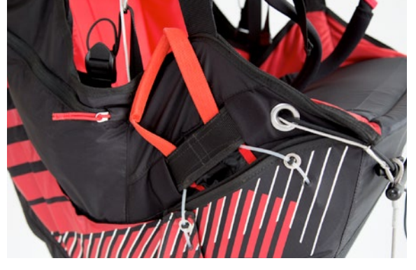
Easypull rescue container with ergonomic release handle. Easypull Rettungscontainer mit ergonomischem Auslösegriff.