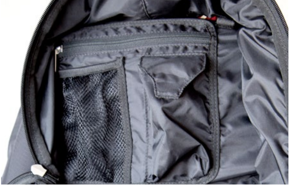
Generously dimensioned back compartment with additional inside pockets. Großzügig dimensioniertes Rückenfach mit zusätzlichen Innenfächern.